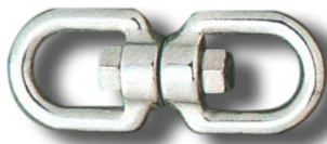
5 – 6 – 8 mm